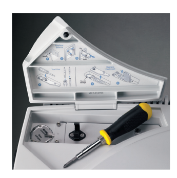
Optional tungsten halogen source and desiccant compartment are easily accessible