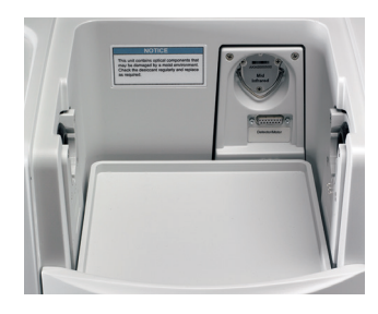
The Nicolet iS20 source is mounted in the sample compartment, allowing quick and easy optimization of data collection