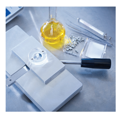
Figure 5. Sealing device for large tin containers.