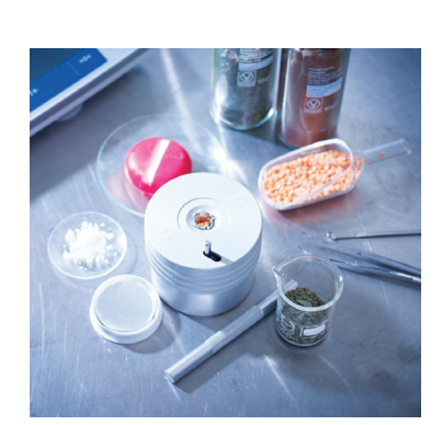
Figure 1. Sealing device for large tin containers.