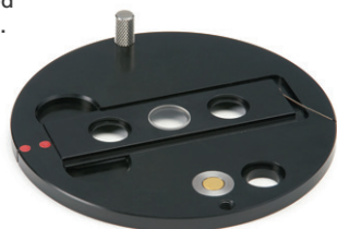
Figure 1. Standard sample plate with gold disc and transmission locations for automated background collection.