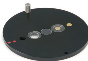
Figure 2. The Thermo Scientific ValPro™ System Qualification Software performance verification plate with transmission, reflection and ATR traceable standards; gold disc and transmission locations for background collection.