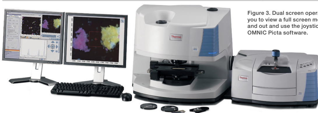
Figure 3. Dual screen operation enables you to view a full screen mosaic, zoom in and out and use the joystick while running OMNIC Picta software.