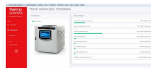
Consumables usage tracking in SmartStatus

Notifications help you to better plan for preventive maintenance, remove waste and ensure optimal instrument performance every day.