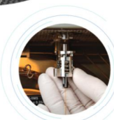
Thermo Scientific™ iConnect™ Column Lock enables rapid, tool- and leak-free column installation, without risk of over tightening.

Easy and safe operations due to the self-alignment, single-cable connection and "best injection selection" setting for automatic optimization of the injection mode through injector type recognition.