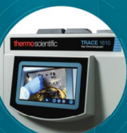
The large and intuitive touchscreen provides instrument control, method development, status information, instrument health monitoring, and interactive graphics and video tutorials.

Real-time signal, diagnostics, and run log are easy to view. Video tutorials, and interactive graphics for common tasks can be displayed to speed learning and support users' daily work.