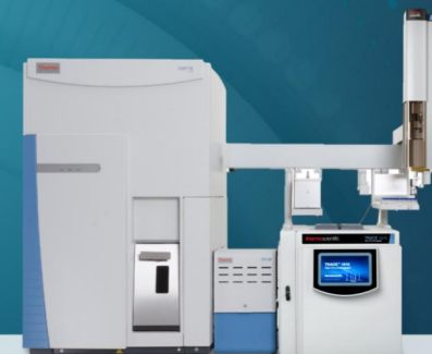
Thermo Scientific™ GCI Series Interface for GC-ICP-MS Seamlessly integrates GC and inductively-coupled plasma mass spectrometry (ICP-MS) systems as an easy-to-use solution for advanced speciation studies of volatile compounds.