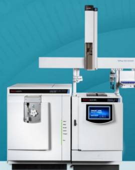
Thermo Scientific™ Orbitrap Exploris™ GC mass spectrometers For unknown compound identification or analysis of difficult matrices, Thermo Scientific™ Orbitrap™ technology provides high-resolution accurate-mass (HRAM) data with sub-ppm mass accuracy. Acquire full-scan data for targeted and untargeted screening, confirmation, unknown identification, quantitation, and retrospective analysis.