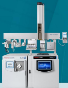
Thermo Scientific™ ISQ™ 7610 single quadrupole GC-MS system Extended uptime and robustness maximize sample throughput for targeted and untargeted screening, confirmation and quantitation using library-searchable full-scan mass spectra or selected ion monitoring (SIM).

The TRACE 1600 Series Gas Chromatograph offers extended uptime, cost savings, and ease of use that augments the power of the comprehensive portfolio of Thermo Scientific systems for hyphenated methods.