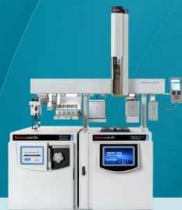
Thermo Scientific™ TSQ™ 9610 triple quadrupole GC-MS/MS system Highest selectivity and sensitivity with high-speed, high-capacity MS/MS selected reaction monitoring (SRM) for quantitation of target compounds in complex matrices.