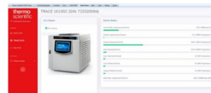
Consumables usage tracking in SmartStatus

Notifications help you to better plan for preventive maintenance, remove waste and ensure optimal instrument performance every day.