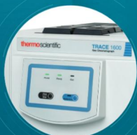
The TRACE 1600 Gas Chromatograph includes a single-button start/stop interface for essential user interaction with the instrument.

If you don't need or want local instrument control access, take advantage of the TRACE 1600 Gas Chromatograph's simplified single-button start/stop user interface. It's ideal for local or remote control using Thermo Scientific™ Chromeleon™ Chromatography Data System (CDS) software and when only essential instrument interaction is preferred to safeguard methods.